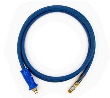
B455144B - The prefix "B" changes the 12ft base hose to blue and the suffix "B" adds a blue Dura-Grip