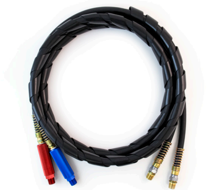
455144ASETW - No prefix keeps the 12ft hoses black. The suffix "ASETW" adds aluminum grips, makes it a pair of hoses instead of one, and adds spiral wrap.