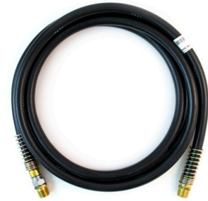
455144 - Base part number only. 12ft black hose with no handles, just 1/2" fittings

Need a custom length, a non-standard component, or something else? Just give Customer Service a call and chances are, we can have your unique hose built for you in just 48 hours.