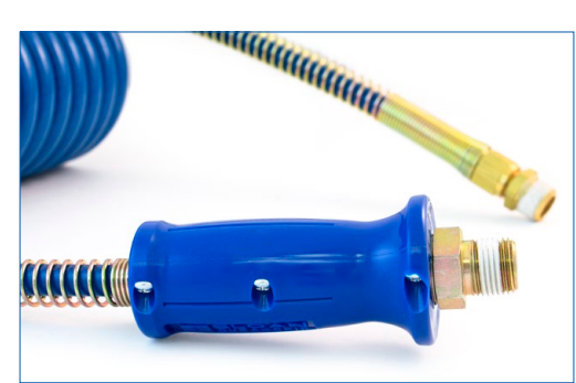
Coiled Air Assembly with a Dura-Grip Handle