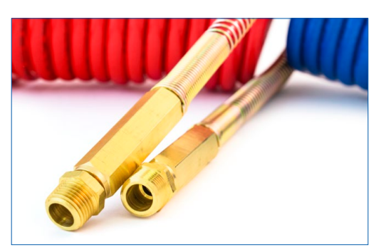
Coiled Air Assemblies with Brass Handles