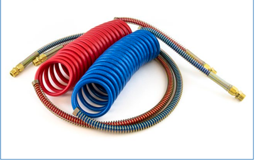
Set of 15' Coiled Air Assemblies with 40" Leads