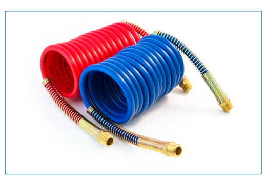
Set of 12' MAXXValue™ Coiled Air Assemblies