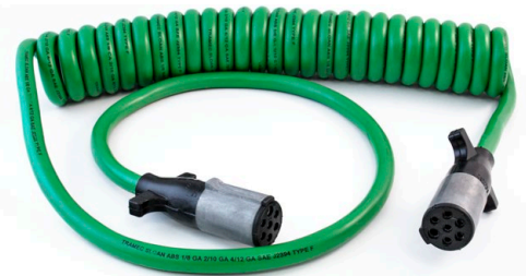
4D017: Coiled ABS Cable with Standard Jacket, Two Straight Plugs, Zinc Sleeves, 15' with One 48" Lead