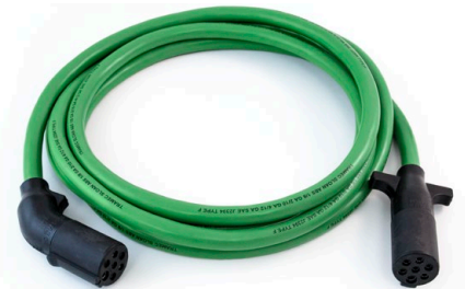
4CD12: Straight ABS Cable with Standard Jacket, One Angled Plug, Nylon Sleeves, 12' Length