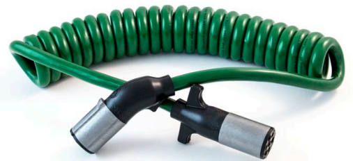
4A115: Coiled ABS Cable with XT Jacket, One Angled Plug, Zinc Sleeves, 15' with Two 12" Leads

HEAVY DUTY XT JACKET: Provides Superior Cut, Tear & Abrasion Resistance. Plus, Excellent Coil Retention & Flexibility in Both Cold & Warm Weather Extremes.